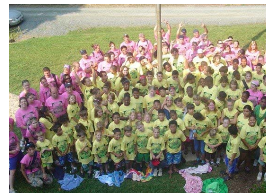
Our 2007 Deaf Camp

Sertoma Members Working Together to Support the Sertoma Deaf Camp and the Sertoma 4-H Educational Center