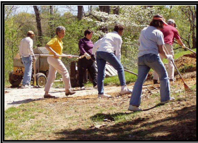
Sertomans at work during April 2007 Work Weekend